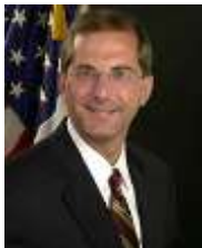
Secretary, HHS Alex Azar