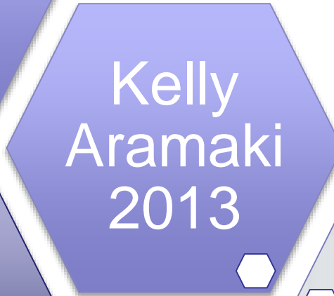
Kelly Aramaki 2013