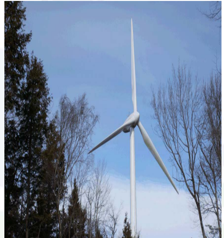
Berkshire East Ski Area's 900KW Wind Turbine