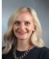
Senator Lauren Arthur