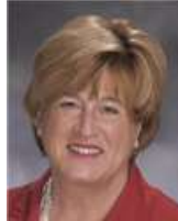
Senator Karla Eslinger