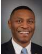
Senator Brian Williams

Visit www.ncsl.org/moearly to access resources from today's meeting