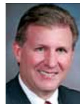
SENATOR CURTIS BRAMBLE UTAH