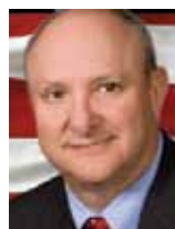
SENATOR LUKE KENLEY INDIANA

The Indiana virtual campus is an outpost of the successful all-online college established in 1997 by the governors of 19 Western states.