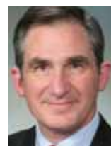
SENATOR JIM KASTAMA WASHINGTON

The growing emphasis of online education is pushing colleges in 21 states to join with The National Center for Academic Transformation to fundamentally redesign their introductory and remedial courses. Participating academic departments will be able to teach more students at lower costs by using computer-based instruction and online forums to supplement or replace classroom lectures. This spring, 38 redesigned basic-level math classes will be part of a pilot project at community colleges across the nation as part of the center’s Changing the Equation program.