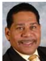
REPRESENTATIVE REGINALD MEEKS KENTUCKY