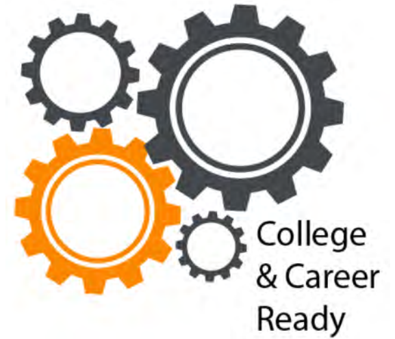
College & Career Ready