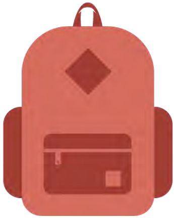
Competencies ~ 2 Credits