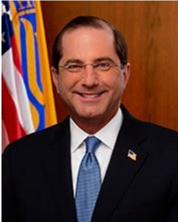
Secretary, HHS Alex Azar