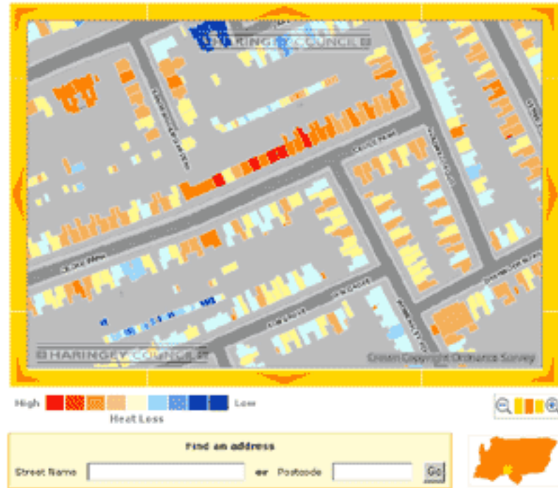
Infrared map of Haringey, UK