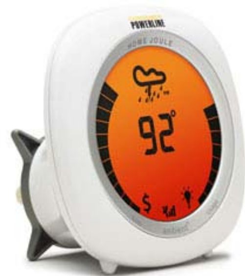
“Joule meter” from ConsumerPowerline