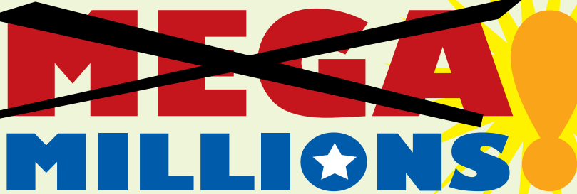
LOTTERY REVENUE—NO LONGER A SURE BET (FY 2009 COMPARED WITH FY 2008)